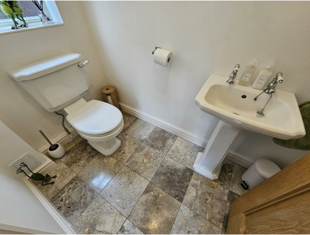
A fitted WC with toilet and wash basin, ceiling light and wall mounted radiator with window to side elevation.